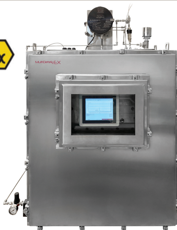
▶ MultiDetek2 EX

An innovative design based on simplicity. The standard industrial compact GC model MultiDetek2 is now integrated inside a Stainless Steel certified (ATEX-IECEx) purged enclosure to be used in Zone1 and Zone 2 hazardous areas. This "EX" series allows to keep the proven robust industrial platform features of the MultiDetek2 with its LDChroma software interface. It also allows to mount more than one GC or other instruments/accessories in the same MultiDetek2 EX purged enclosure. On top of that, using the standard rackmount platform of the MultiDetek2 mounted on a slide out system makes it easy to swap units inside the enclosure for maintenance or application upgrade. A multi streams/GCs and methods all in one system approaches was the objective with the launch of the MultiDetek2 EX series.